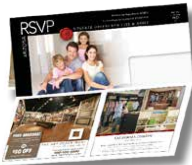
New Homeowner Mailing REACH NEW HOMEOWNERS