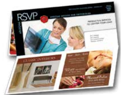
Business to Business Mailing REACH BUSINESS CATEGORIES