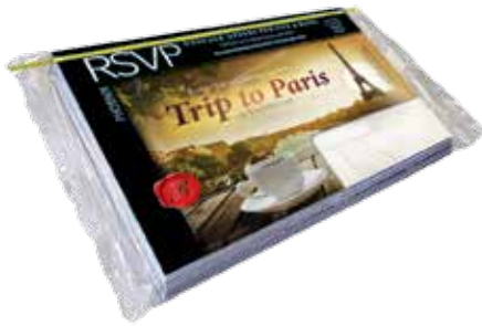
Consumer Postcard Deck REACH THE MASS AFFLUENT

WE CAN HELP YOU WITH ALL YOUR MARKETING NEEDS.