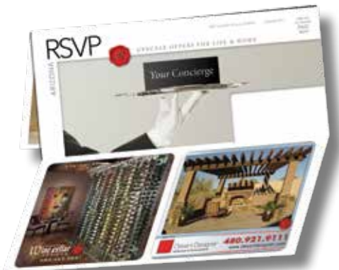
Concierge Mailing REACH MILLIONAIRES